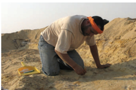
Years of painstaking research revealed the fossil.